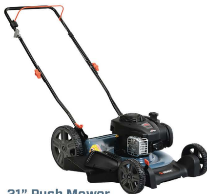
21" Push Mower LSPG-M4