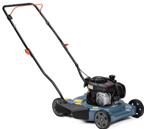
20" Push Mower LSPG-L2