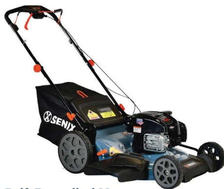
22" Self-Propelled Mower LSSG-H2