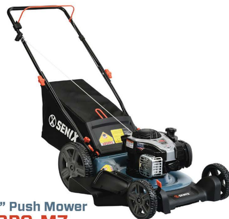
21" Push Mower LSPG-M7