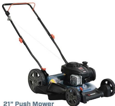
21" Push Mower LSPG-M6