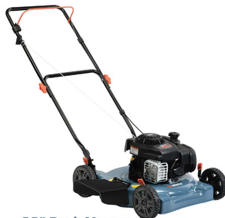
20" Push Mower LSPG-L3