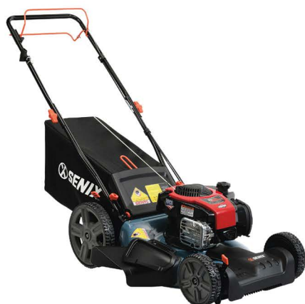
21" Self-Propelled Mower LSSG-M1