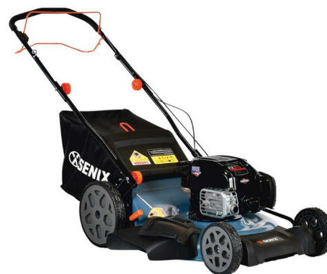
22" Self-Propelled Mower LSSG-H1