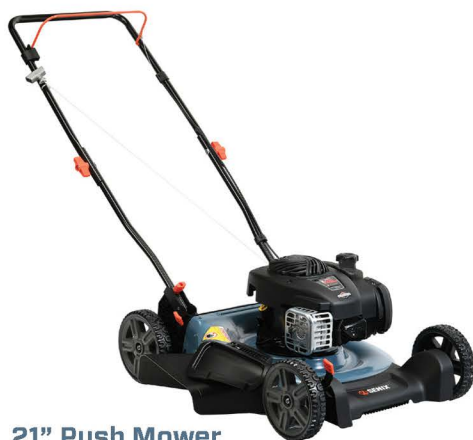
21" Push Mower LSPG-M3