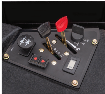
Python | Control Panel