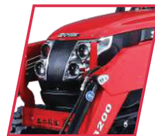
100% METAL HOOD