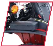
STANDARD TOOL BOX