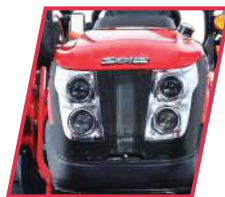
STANDARD PROJECTOR HEADLAMPS