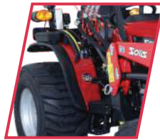
STANDARD GRAB RAILS