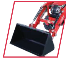
HEAVY DUTY FRONT LOADER