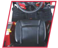
STANDARD FLOOR MAT