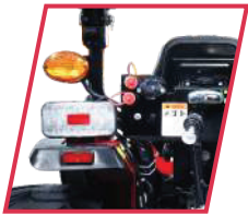
STANDARD HYDRAULIC REAR REMOTES