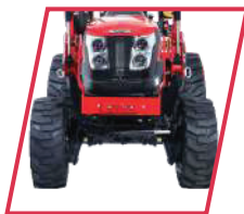
HEAVY DUTY FRONT AXLE