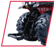
STANDARD REAR SWING DRAWBAR