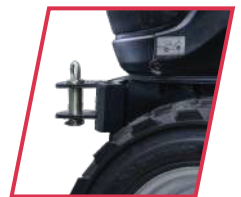
STANDARD FRONT TOW HOOK