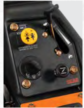
Convenient operator station puts the mower controls within easy reach.