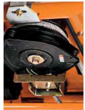
Ogura GT1 (74 ft lb) PTO clutch brake for easy deck engagement. Adjustable internal air gap for long life.