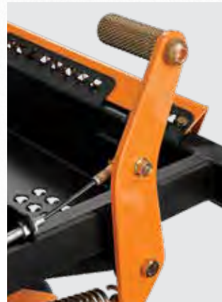
Cutter-deck-lift foot pedal is spring-assisted and makes raising the cutter deck smooth and easy.