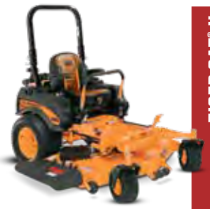
TIGER CAT II