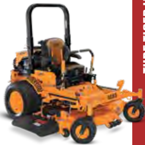
TURF TIGER II™