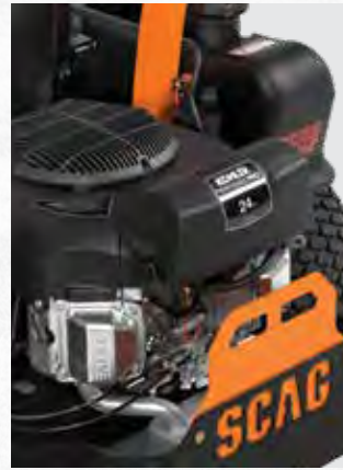
Powerful V-Twin engine options up to 26 hp provide smooth, reliable power.