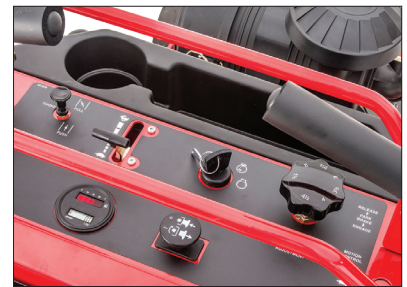
Venom | Control Panel