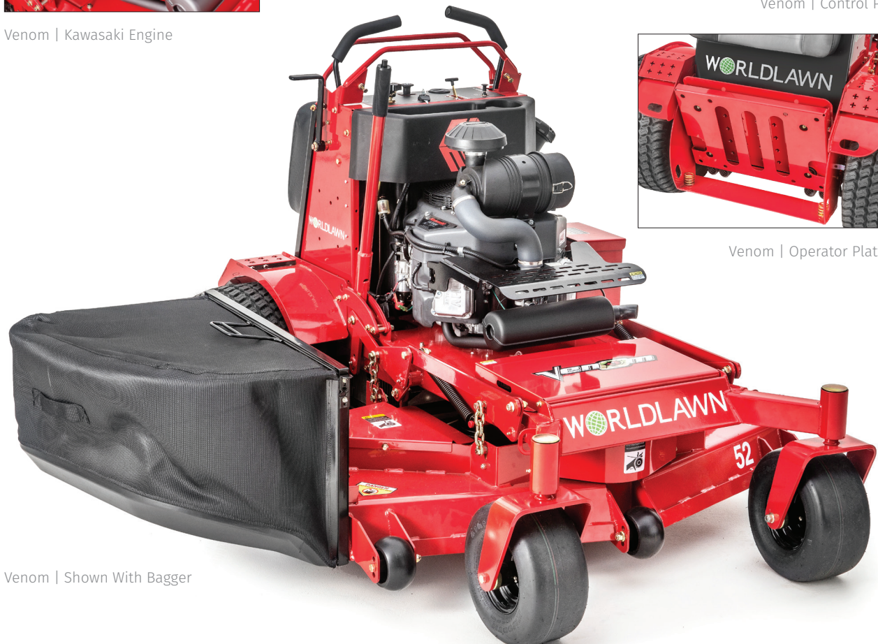
Venom | Shown With Bagger