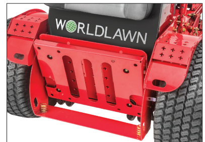
Venom | Operator Platform