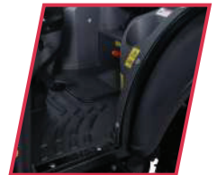
STANDARD FLOOR MAT