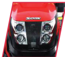
STANDARD PROJECTOR HEADLAMPS