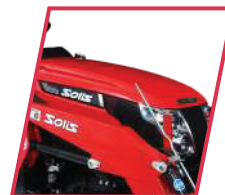
100% METAL HOOD