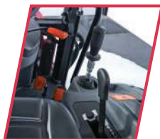
INTEGRATED LOADER JOYSTICK