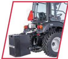
STANDARD REAR SWING DRAWBAR