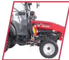
STANDARD MID PTO