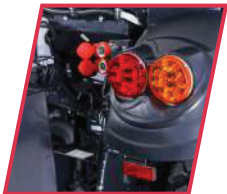
STANDARD HYDRAULIC REAR REMOTES