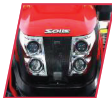
STANDARD PROJECTOR HEADLAMPS