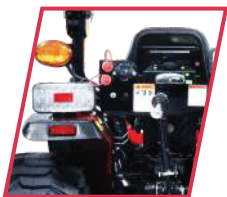
STANDARD HYDRAULIC REAR REMOTES