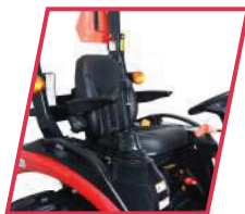
INTEGRATED LOADER JOYSTICK