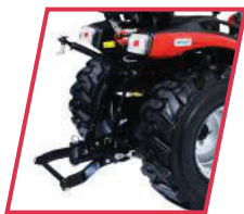
STANDARD REAR SWING DRAWBAR