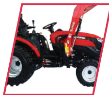
STANDARD MID PTO