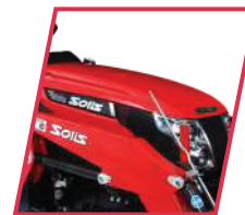
100% METAL HOOD