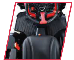
STANDARD FLOOR MAT