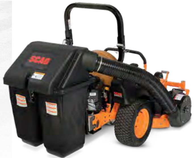
2-Bag Grass Catcher with Spindle-Driven Blower See page 48 for details.

"The quality-of-cut, drive-motor power and comfort."