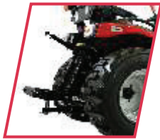
STANDARD REAR SWING DRAWBAR