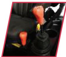
SHUTTLE (FORWARD /REVERSE)