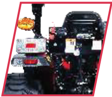
STANDARD HYDRAULIC REAR REMOTES