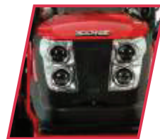
STANDARD PROJECTOR HEADLAMPS