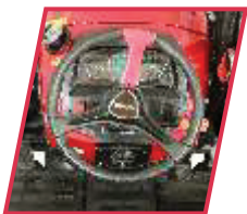
STANDARD STYLISH STEERING WHEEL