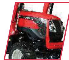
100% METAL HOOD