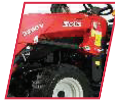
9 FORWARD AND 9 REVERSE SPEED TRANSMISSIONS