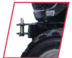
STANDARD FRONT TOW HOOK