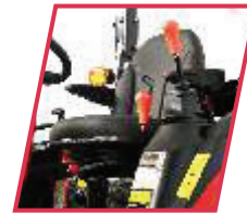
STANDARD SEAT WITH ARMREST