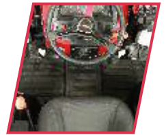
STANDARD FLOOR MAT